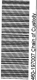
460-197007 Chain of Custody

Possible Hazard Identification: Non-Hazard flammable irritant Poison B Unknown